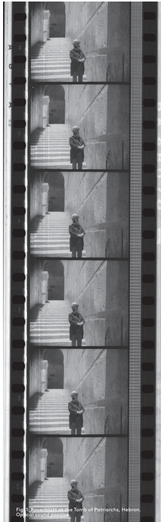
Fig. 1: Rosenblatt at the Tomb of Patriarchs, Hebron. Optical sound positive.

The main problem with the editing of the original film was the lack of its consistency, geographically speaking. Scenes were jumping from one location to another, without any logical pattern. Editor Irit Eshet suggested ordering them according to the text of the opening titles, thus telling the story of former days and of Jewish life in Palestine before the Zionist